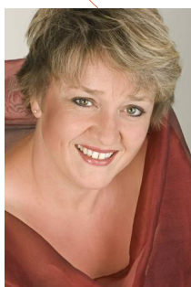
Sibylla Rubens Sopran