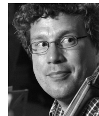
Cellist and artistic director: Le Concert Lorrain